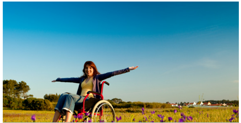
Celebrating renewed legal rights for loved ones with disabilities

Now, beneficiaries of special needs trusts who have disabilities can protect the access of the funds that they inherit, or are granted in the courtroom, without having to sacrifice their essential needs-based government disability benefit. The Special Needs Trust Fairness Act allows people with disabilities to take their financial power and freedom back, without their accounts shrinking from taxation and funds